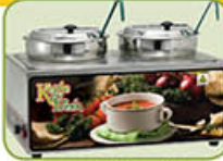
Also available without menu board